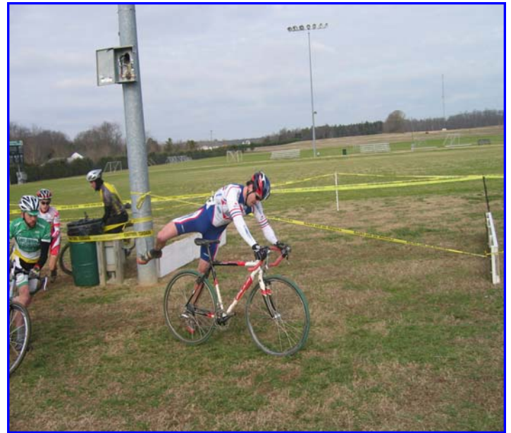
Proof that Chicken can fly!

On the skill side, you can make lots of time if you are a strong rider and fast on the open, flat part and then lose it all to a weaker rider that just happens to be able to get off the bike, over the barrier and back into his pedals much better than you. There is nothing more aggravating than having to chase the same person down lap after lap because they are smoking you over the barriers. I spend 30 to 45 minutes a week in August and September practicing getting off the bike into a dead run, jumping my barriers and getting back onto the bike and into my pedals as quickly and as smoothly as I can. If you think that's not work, try doing it 60 or 80 times in a row.